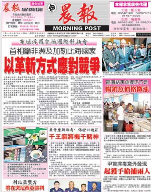
Front Page Panel