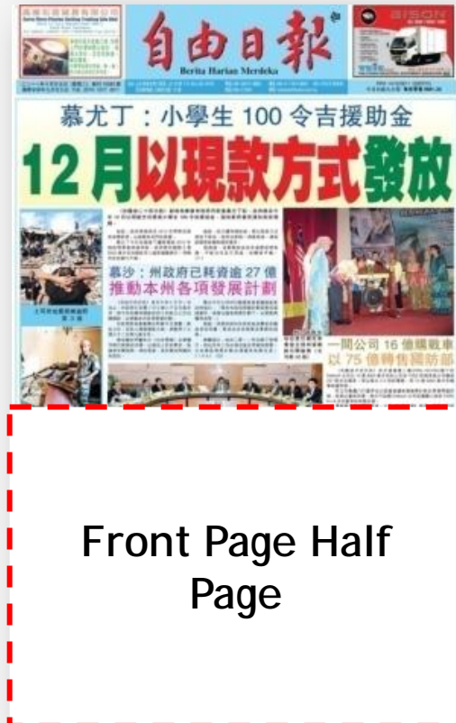
Front Page Half Page

MDN Size : 5.5cm (H) x 8.0cm (W) MPT size : 6.5cm (H) x 9.0cm (W) Color : Full Color Position : Main Paper Front Pg Cost : RM 350.00